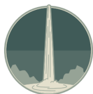
WATERFALL & CAVE TOUR

Discover ancient geological wonders and the majestic waterfall hidden deep within Lookout Mountain on a guided Ruby Falls cave adventure. Choose a Cave Walk to the Waterfall, after-hours Lantern Tour, early morning Gentle Walking Tour or Low Sensory Cave Tour! The scenic journey to the waterfall begins with a glass-front elevator ride descending 260 feet into historic Lookout Mountain followed by a guide-led walk along the cavern trail with up-close views of remarkable formations. The round-trip walk is just under 1-mile and the year-round, 60-degree cave temperature keeps guests comfortable.